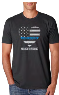
Gannon Heart - Short Sleeve $25