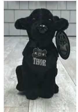
Thor Plush - $20