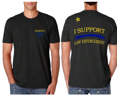
YPF Respect - Short Sleeve $25