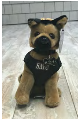
Satu Plush - $20