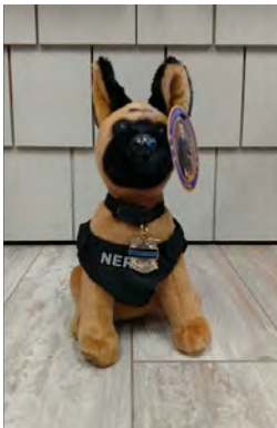
Nero Plush - $20

https://www.kscopestore.com/ypd_gannon/shop/home