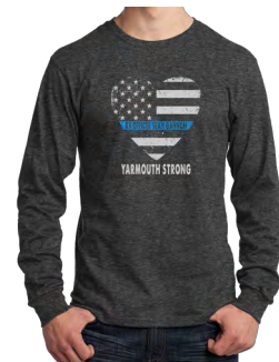
Gannon Heart - Long Sleeve $35